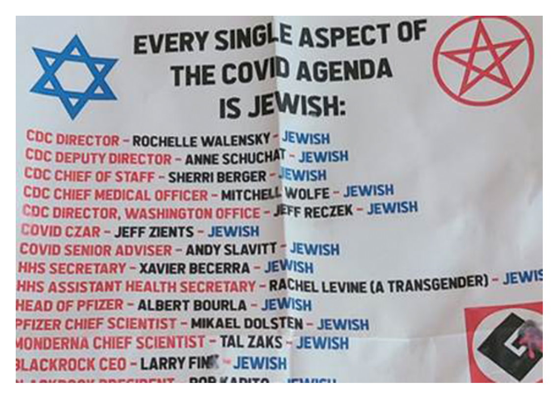
Antisemitic GDL propaganda – Texas 2021

Examples of propaganda targeting Jewish institutions: