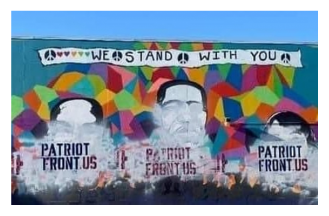
Patriot Front stenciling over BLM mural – Oregon July 2021

New Jersey European Heritage Association was responsible for 219 propaganda incidents in 2021, roughly five percent of the total propaganda activity nationwide, a 57 percent drop-off from their 2020 efforts. In 2021, its propaganda was recorded in 28 states but most frequently reported in New Jersey, Pennsylvania, New York and Florida.