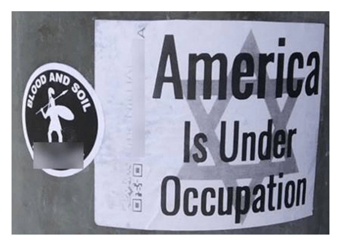
Antisemitic propaganda from NJEHA - New York May 2021

Folkish Resistance Movement (FRM) was responsible for the third highest number of propaganda incidents in 2021 and 50 percent of antisemitic propaganda incidents in 2021. The group's propaganda was recorded in 19 states but was found most frequently in Minnesota, Mississippi, Arizona, Colorado and Texas.