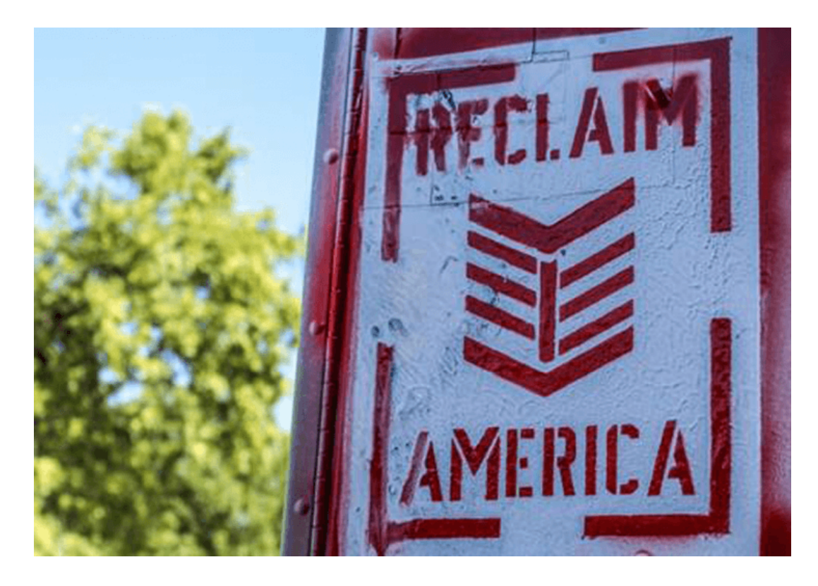
Patriot Front stenciled graffiti – Texas September 2021

Massachusetts, Texas and Maryland, and members were responsible for 190 of the 232 (or 82 percent) of distributions on college campuses, as well as the majority (or 94 percent) of white supremacist stenciled graffiti.