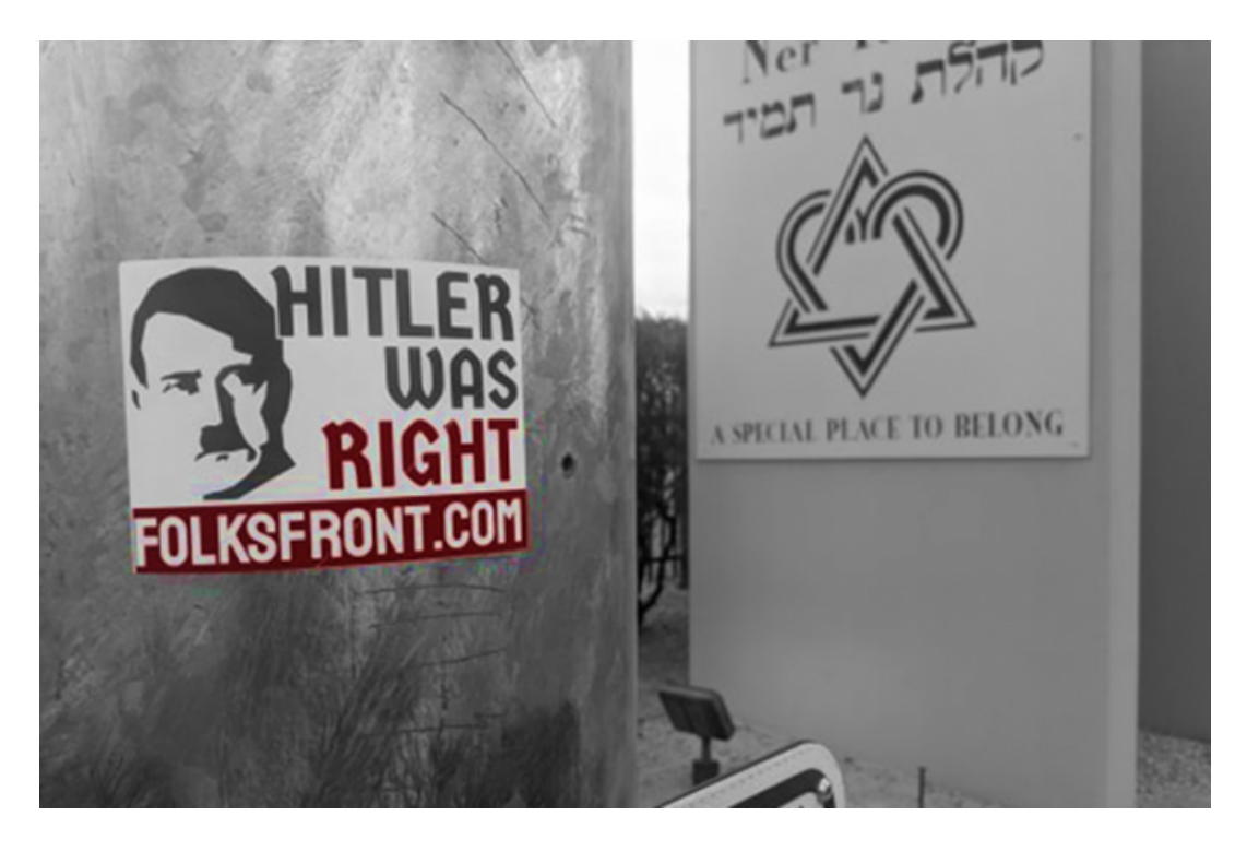
Antisemitic propaganda placed outside a synagogue – Nevada April 2021

December 2021: Patriot Front propaganda was found at the Jewish Community Center in Rockville, Maryland.