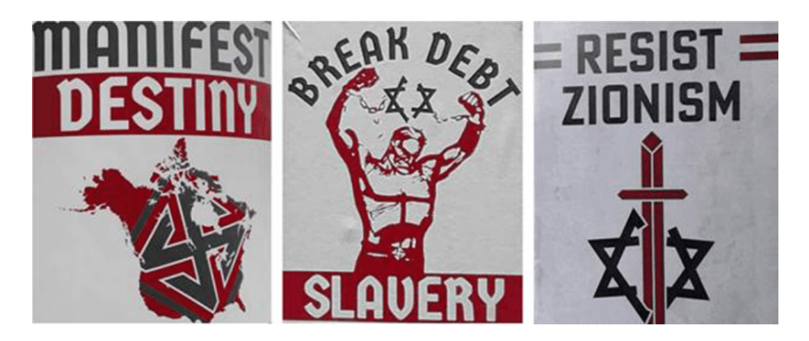
Samples of FRM propaganda – Georgia, Florida, and Minnesota 2021

Propaganda incidents from the neo-Nazi Nationalist Social Club (NSC) decreased to 48 in 2021, dropping 53 percent from 102 distributions in 2020. The group's propaganda is explicitly white supremacist and often presents its membership as a "white defense force" with territorial claims to New England. Some of its 2021 propaganda read: "New England Nationalism = Keep New England white," "Jews rape kids," "White defense force," "Black lives murder white children" and "Jews killed Jesus."