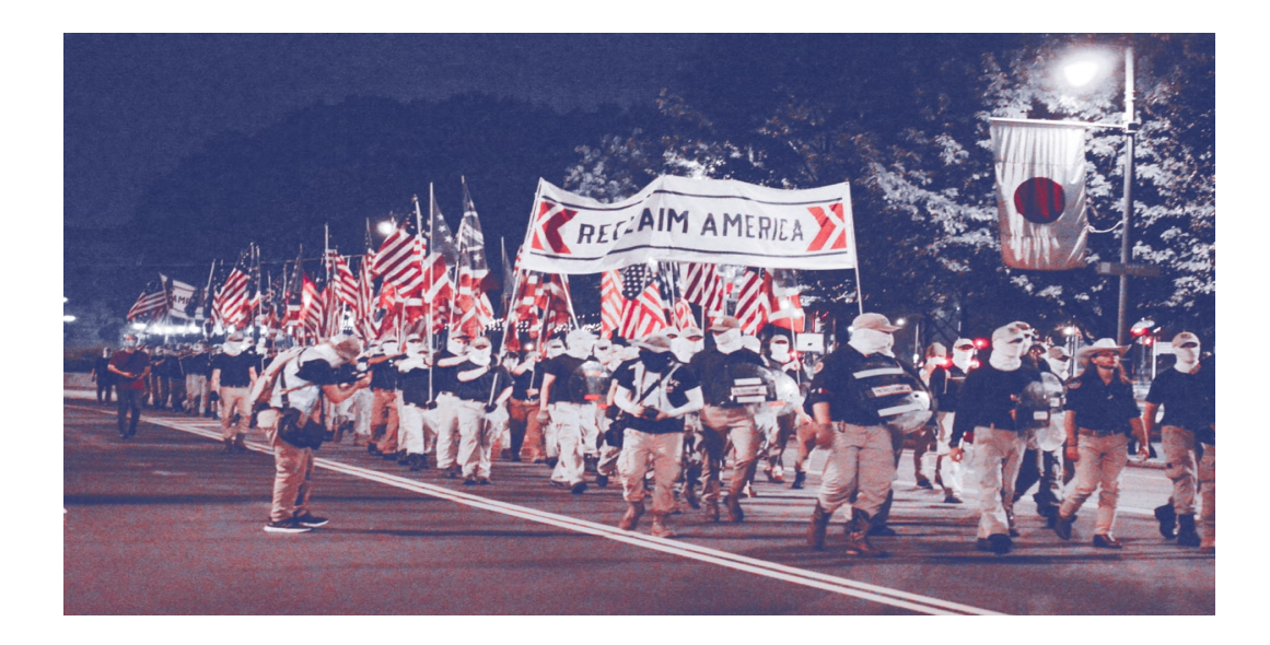
Patriot Front demonstration - Pennsylvania July 2021

NSC held the most (21) flash demonstrations. Often directly protesting their perceived enemies, NSC's 2021 events included a demonstration in front of the Holocaust Memorial in Boston, a protest of critical race theory outside a school board meeting in New Hampshire, a protest outside a progressive bookstore in Massachusetts, and an anti-LGBTQ protest outside the Seacoast Repertory Theatre in New Hampshire.