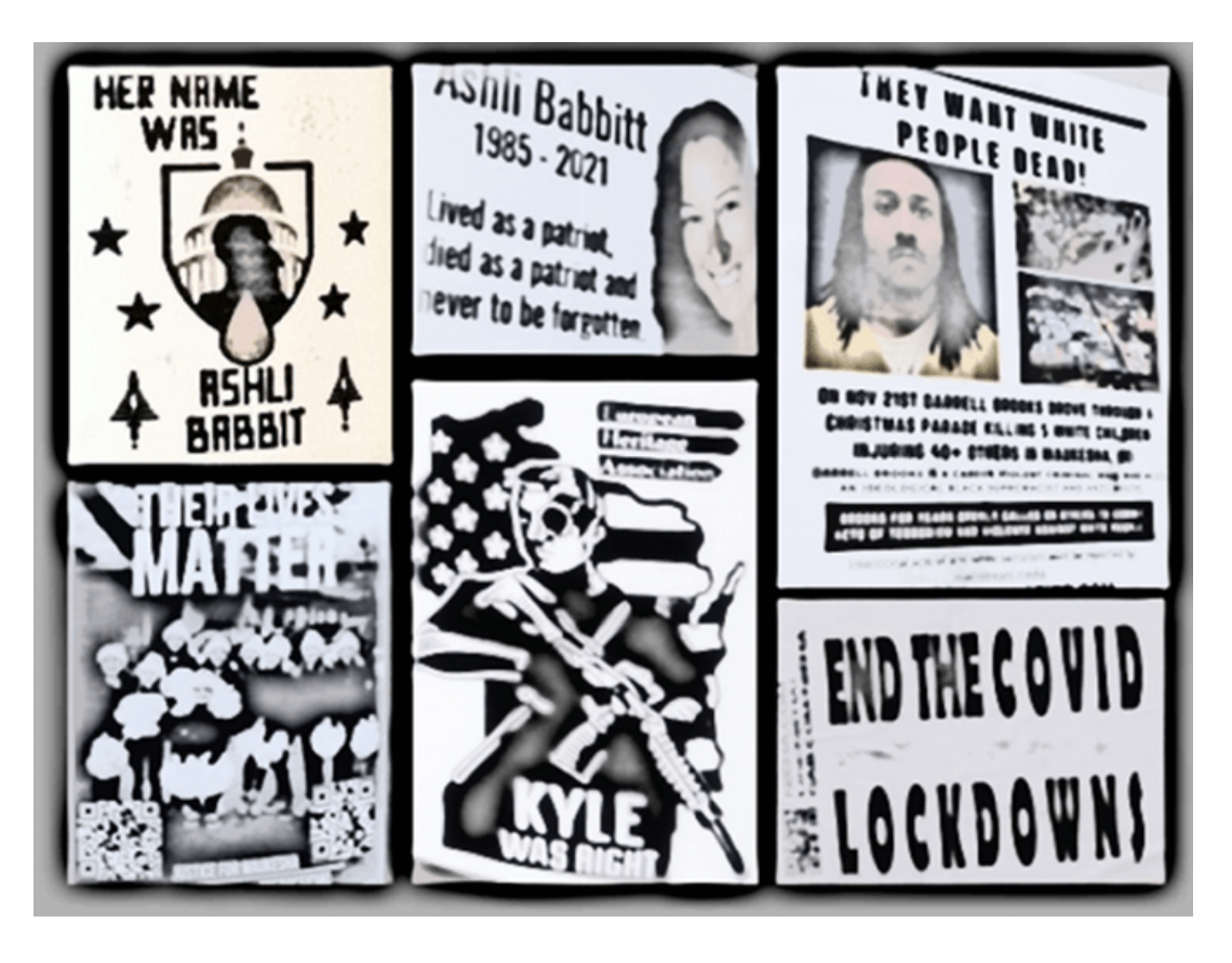
Sampling of white supremacist propaganda focused on current events