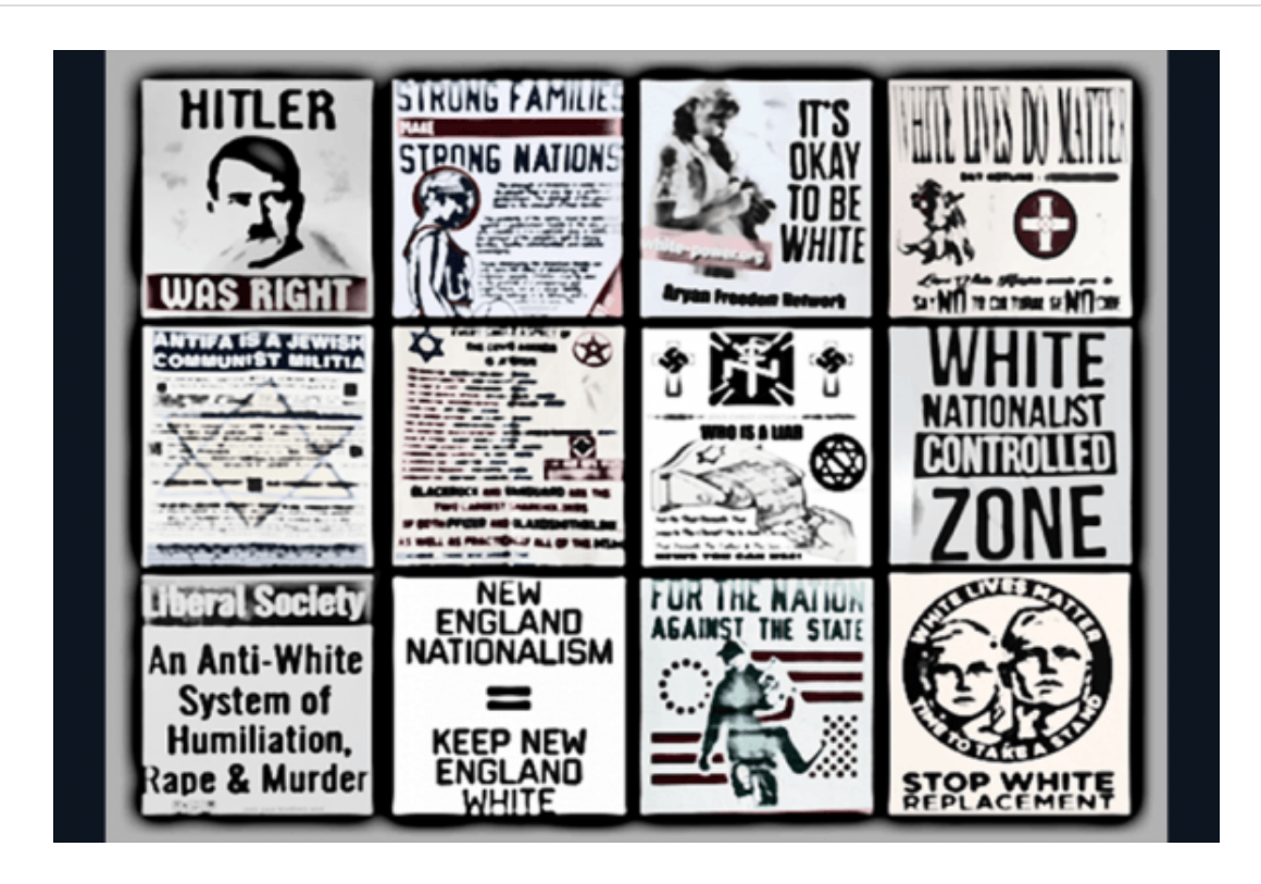
Sampling of 2021 white supremacist propaganda

ADL's annual assessment found white supremacist events more than doubled year-over-year