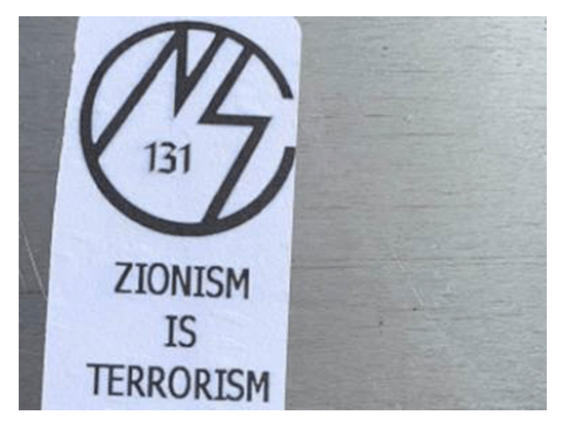
Antisemitic sticker from NSC - Rhode Island 2021