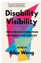
Disability Visibility Alice Wong