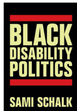
Black Disability Politics Sami Schalk