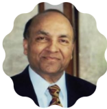
RADHESHYAM M. AGRAWAL, M.D.

The PHRC is comprised of independent and nonpartisan commissioners, appointed by the governor and confirmed by the state Senate. The commissioners act as public liaisons, establish policies, and resolve some cases that are not settled voluntarily.